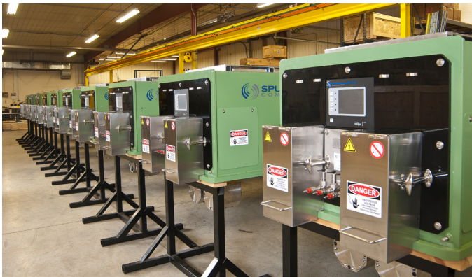
Von Ardenne® 1 /Applied Materials® 2 Digital Clone

SCI provides OEM equipment builders complete turn-key solutions, ready to interface with their systems. SCI can customize these solutions to provide as much controls integration as desired onboard the e-Cathode™.