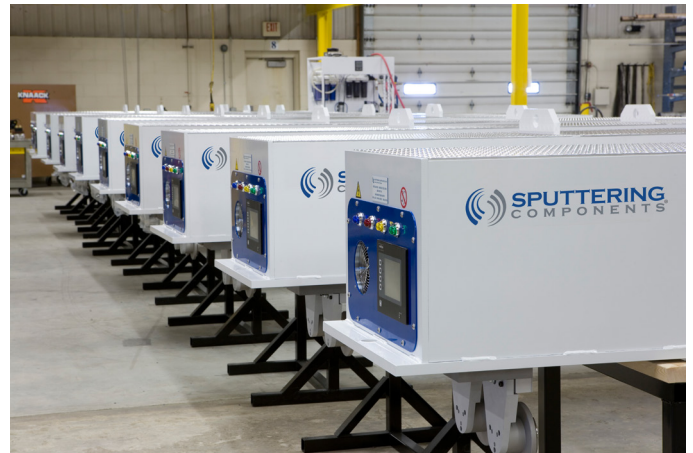
OEM Digital e-Cathode™

End users seeking to add additional cathodes to their system look to SCI for plug-and-play solutions. Our e-Cathode™ clones match all your current external mechanical and electrical interfaces but use SCI end blocks, magnet bars, and cathode control systems.