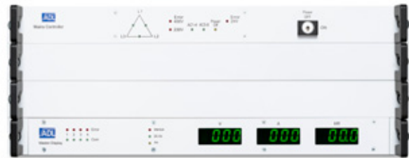
Mains Controller MC 8 and

The HXD 901 – HXD 1401 is a very convenient solution, which combines high power, easy handling and stable processes. The modularly designed unipolar pulse generators are optimized for reactive coating processes for cathodes up to 4 meters in length. The generator recognizes all relevant process parameters fully automatically and adjusts its arc detection and arc erosion independently. To start the operation or to make a target change, no adjustments have to be done by hand. Powerful water cooling guarantees the highest reliability – even in a non-air-conditioned environment.