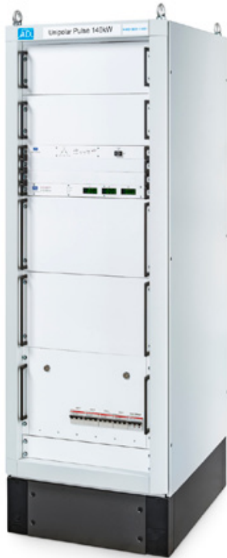
Cabinet - Front view

The HXD 901 – HXD 1401 is a very convenient solution, which combines high power, easy handling and stable processes. The modularly designed unipolar pulse generators are optimized for reactive coating processes for cathodes up to 4 meters in length. The generator recognizes all relevant process parameters fully automatically and adjusts its arc detection and arc erosion independently. To start the operation or to make a target change, no adjustments have to be done by hand. Powerful water cooling guarantees the highest reliability – even in a non-air-conditioned environment.